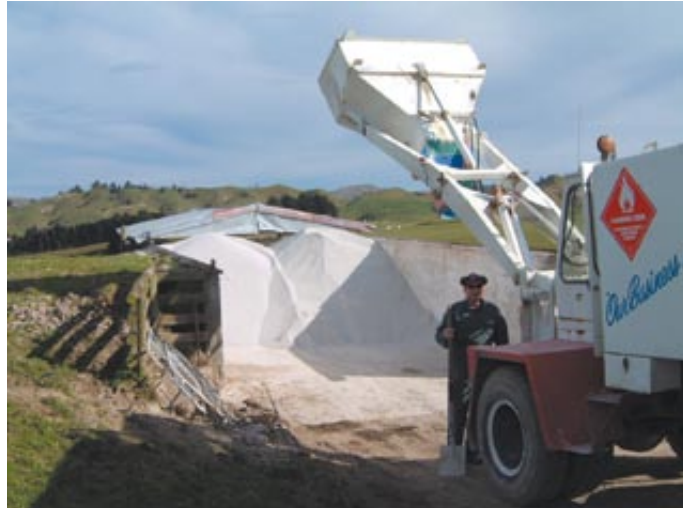
Fertiliser bin with sliding roof in back position for access

The fertiliser storage site may be inspected for suitability on request from owners, farmers, transport operators, top-dressing operators, pilots or loader/drivers. The inspection may be carried out by an appointed health and safety inspector who may refer to this guideline.