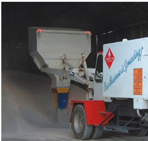
Hopper with free-flowing fertiliser

The procedure for the field test involves two steps: