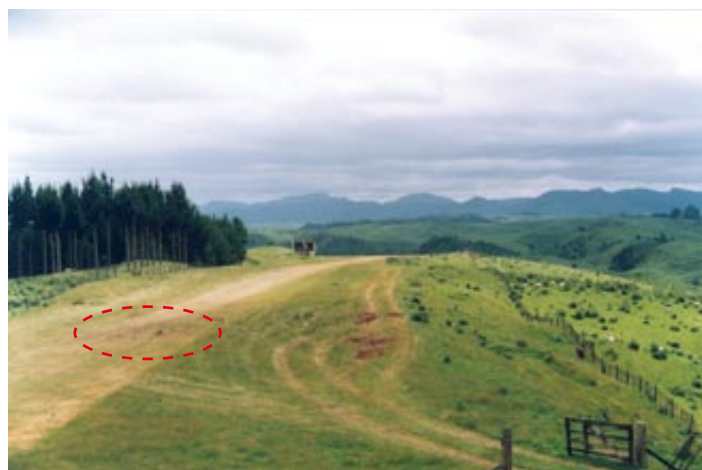
Agricultural airstrip with soft patch

The pilots must report incidents and accidents in accordance with Civil Aviation Authority Rules Part 12 and serious harm under the Health and Safety in Employment Act 1992.