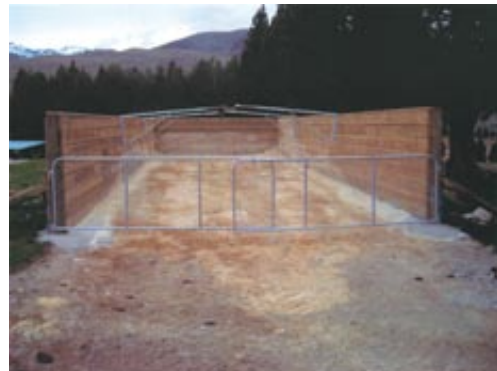
Storage bins and frames for tarpaulin roof