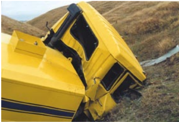
Above and below: Vehicle accidents can and do happen. Always take all practicable steps.

All farm tracks and roads and access points leading to the airstrip and storage site should be clearly identified by signage at the road gate and at any intersections leading to the airstrip. Gates on access roads should be properly hung and swing freely. Branches overhanging access roads should be cut back to provide a clearway for large vehicles.