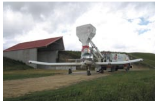
Loading plane using new bin