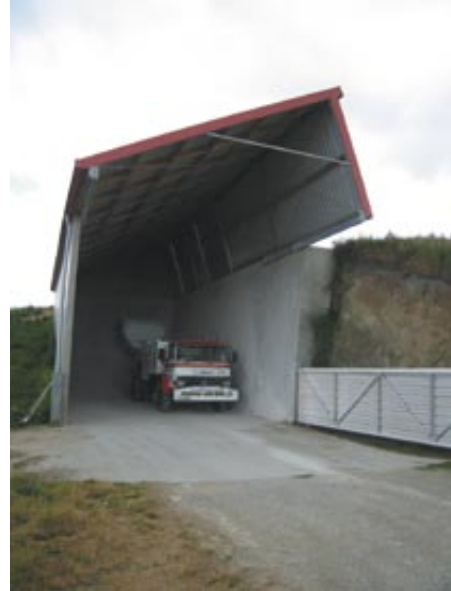
Example of good fertiliser storage facility

Providing a weatherproof storage area for top-dressing fertilisers can therefore reduce the cost of the operation and remove a very real hazard to safe top-dressing operations.