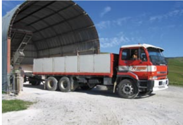
Truck access bin

It is the responsibility of the transport operator not to alter the condition of the fertiliser as it was when uplifted from the manufacturer. Water shall not be added as a dust control measure during transport as this may result in sticky and/or lumpy material.